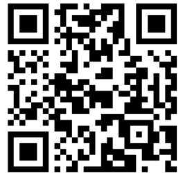
MWHC HOUSING TOOLKIT